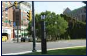
KING STREET METRO